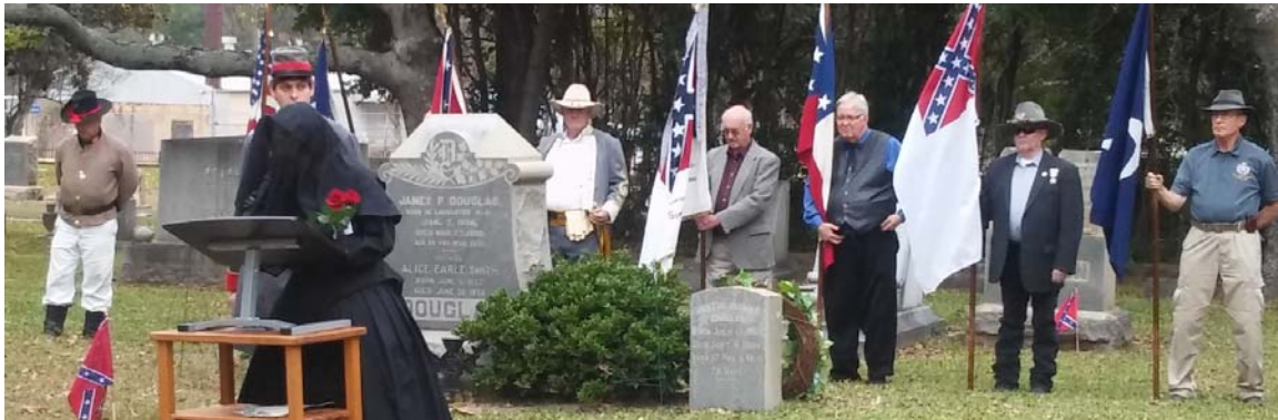
Laying of Roses at Douglas Grave, by: TNOCR- Order of Black Rose