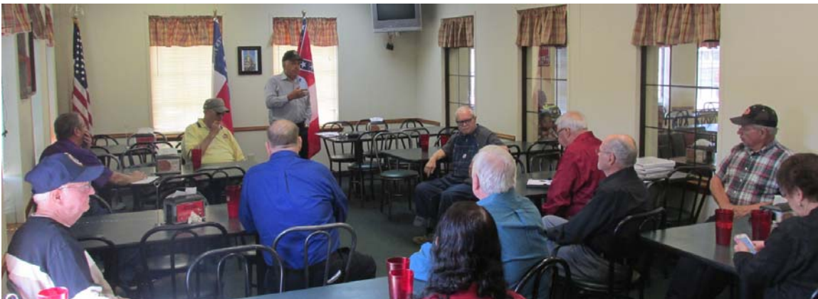
Camp Commander's of the 5 th Brigade all in Attendance.

Representing; Col. DeMorse's 29 th , Texas Cavalry Camp # 2269.