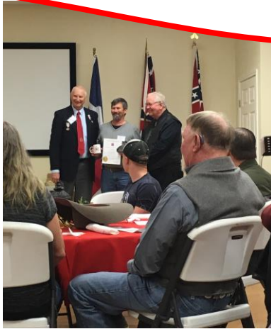
Tyler Camp Welcomes a New Member