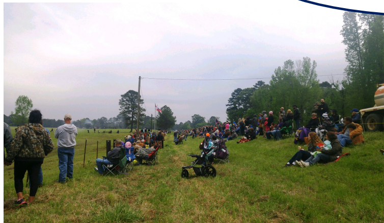
Crowd Watching Battle