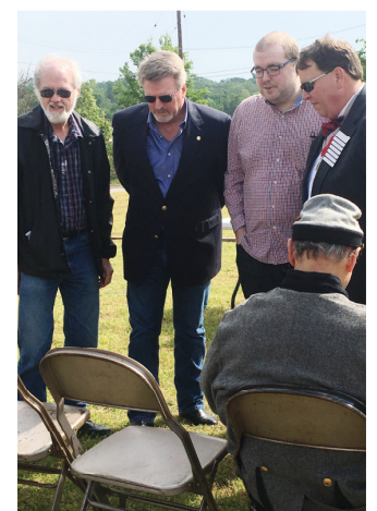
Music by Tonal Recall, Tyler, TX