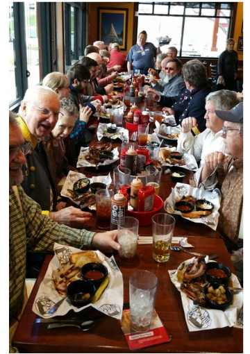
32 Degrees and Snow-- Thawing out with a meal after the parade