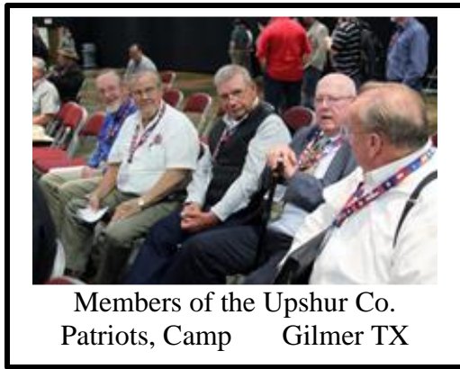
Members of the Upshur Co. Patriots, Camp Gilmer TX