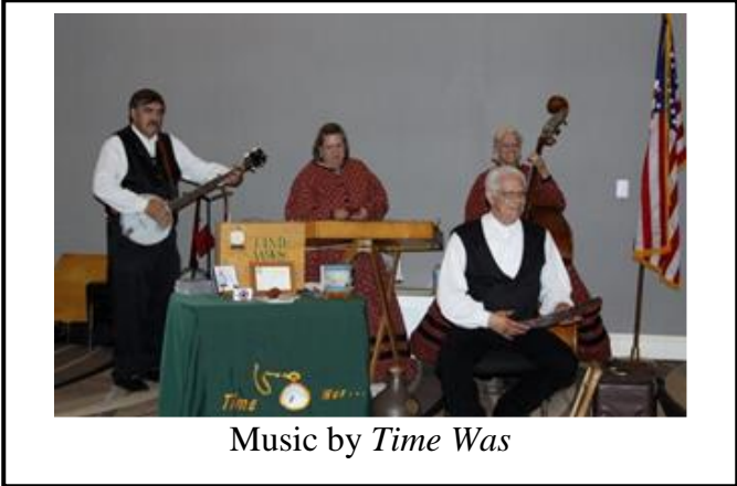
Music by Time Was