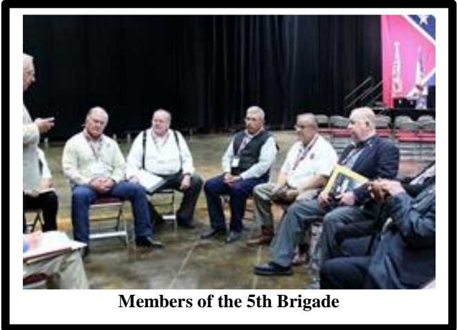
Members of the 5th Brigade