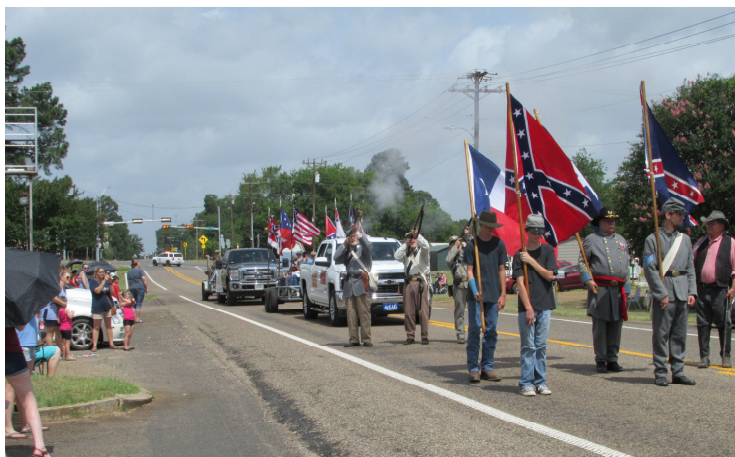
Lone Star Color Guard