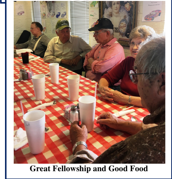
Great Fellowship and Good Food