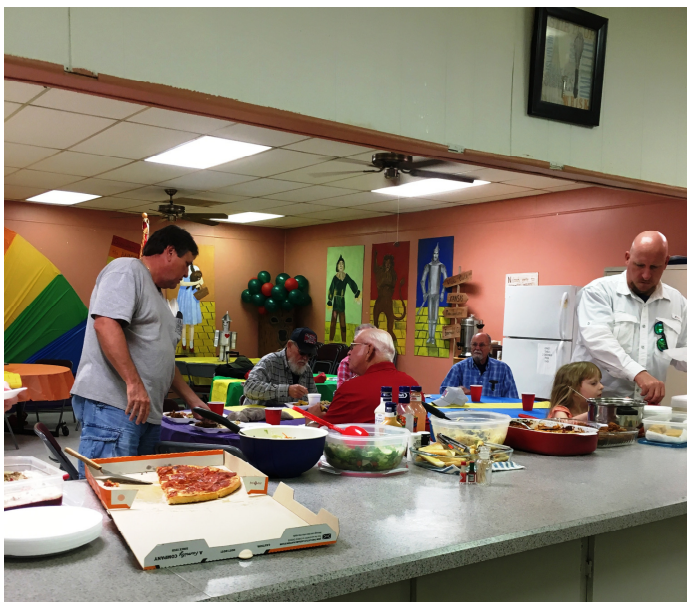
Always Good Food Provided by the Ladies