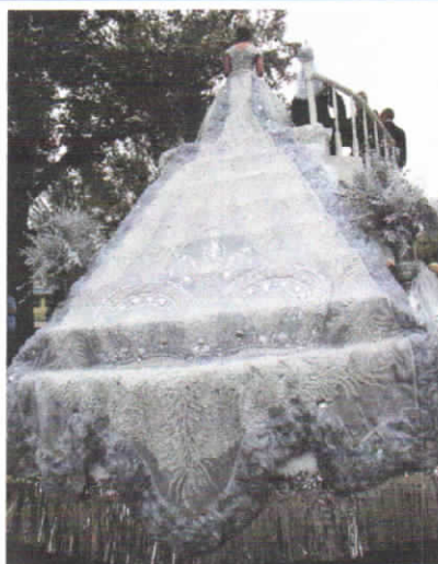
Cape of the Queen hanging down the back of the float