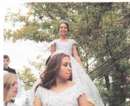
2017 Queen and court