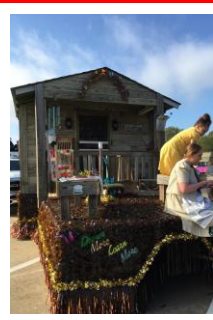
Some of the Floats