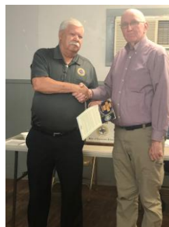
Military Certificate Presented