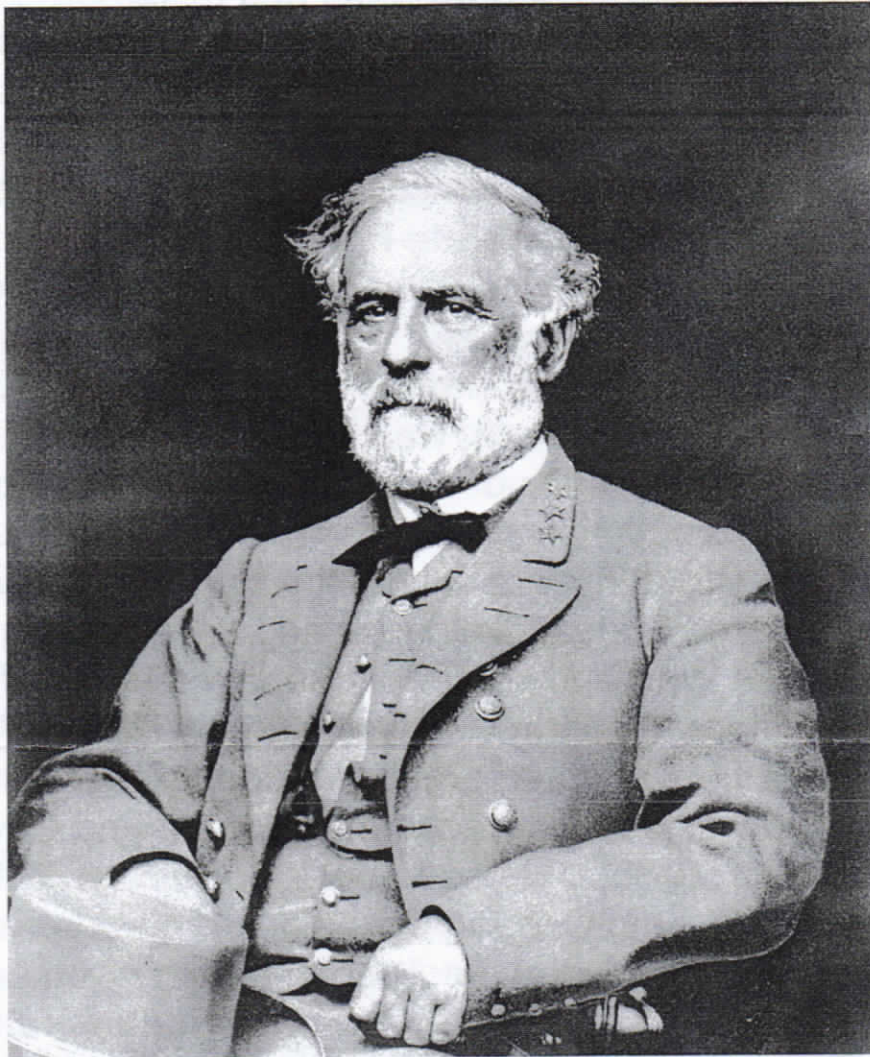
General Robert E. Lee

Stand firmly by your Cannon Let ball and grapeshot fly And trust in God and Davis But keep your powder dry!