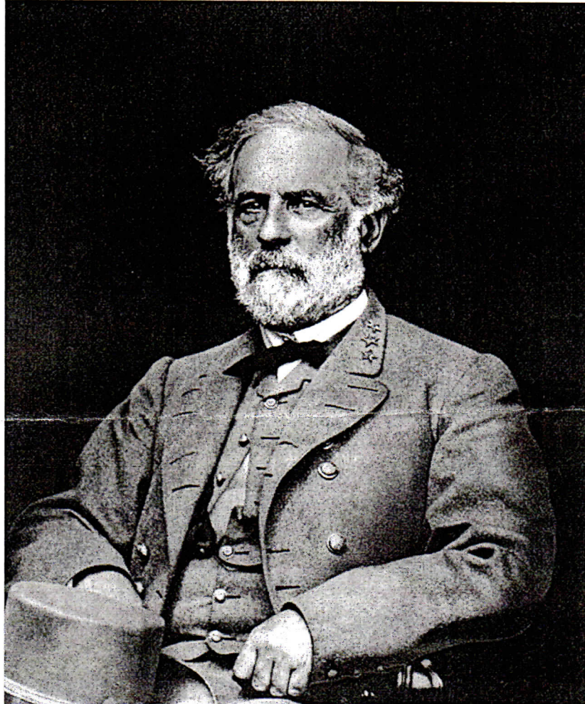
General Robert E. Lee

Stand firmly by your Cannon Let ball and grapeshot fly And trust in God and Davis But keep your powder dry!