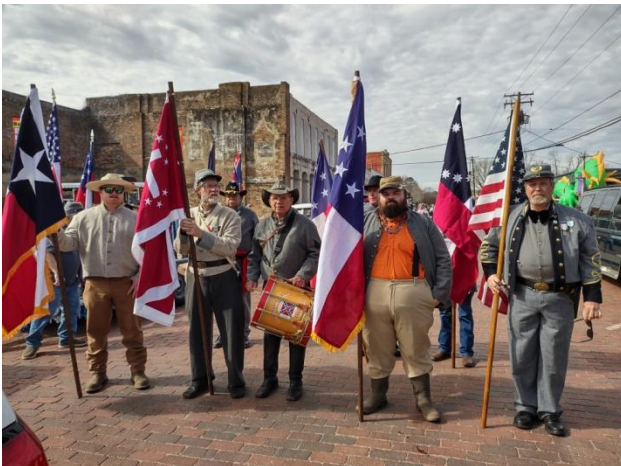
Ready to roll