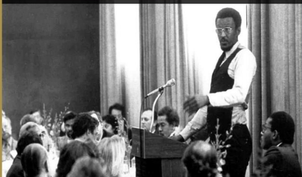
Professor Walter E. Williams

"Confederate generals fought for independence from the Union just as George Washington fought for independence from Great Britain. Those who label Robert E. Lee and other Confederate generals as traitors might also label George Washington a traitor."