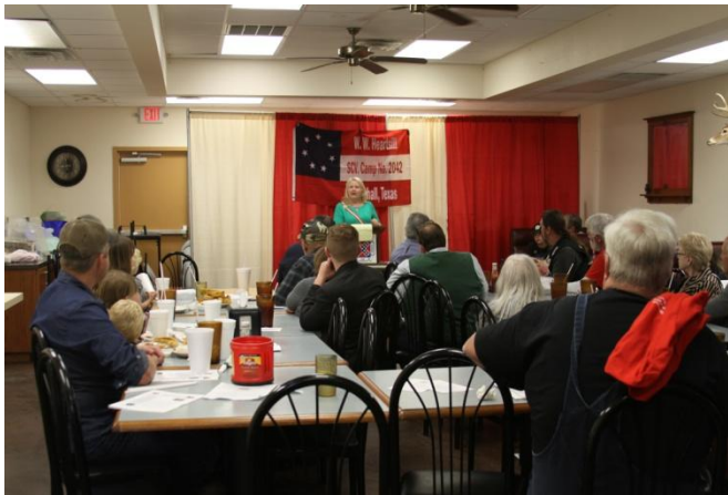
TX UDC President talks to Camp