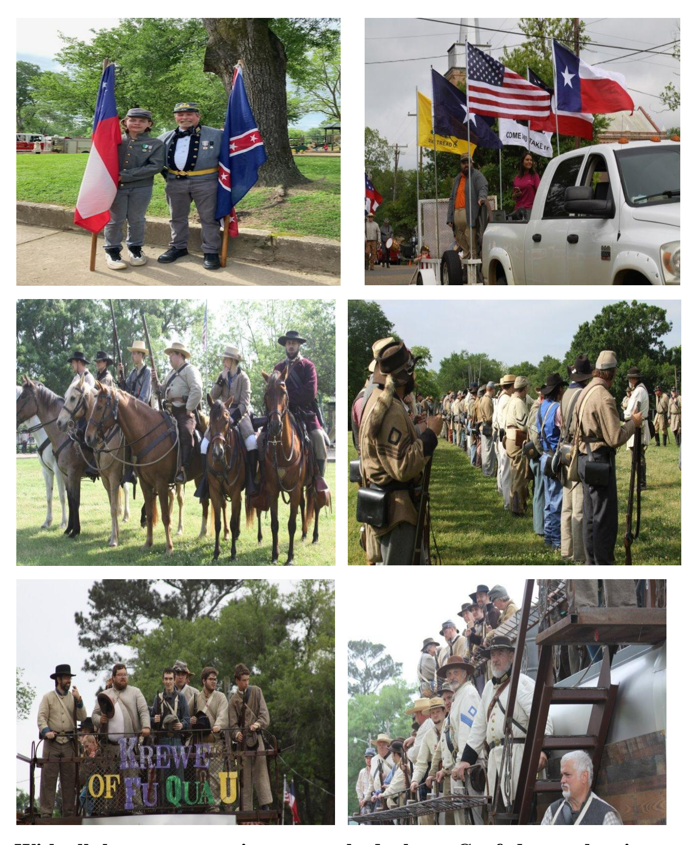
With all the re-enactors in town we had a large Confederate showing.