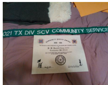
Community Service Award