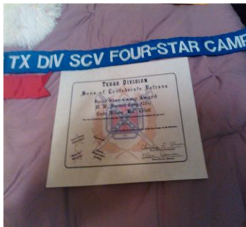
4 Star Camp Award