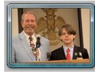
Ready for the Banquet