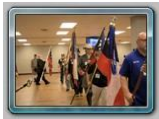
TJ with our Camp Flag