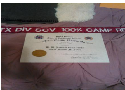
100% Retention Award