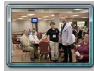
Ready to start