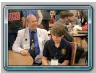
Waiting to start