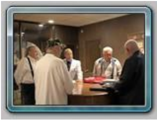
5 th Brigade meeting