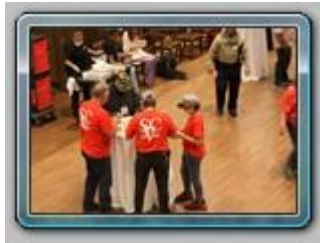
Wearing our Camp shirts