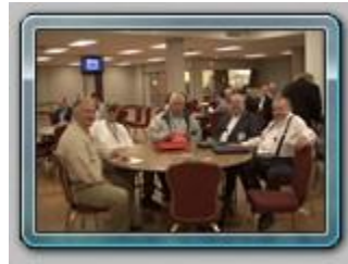
5th Brigade table