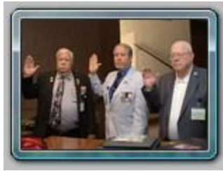
New 5 th Brigade Officers