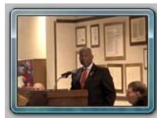
Lt. Col. Alan West