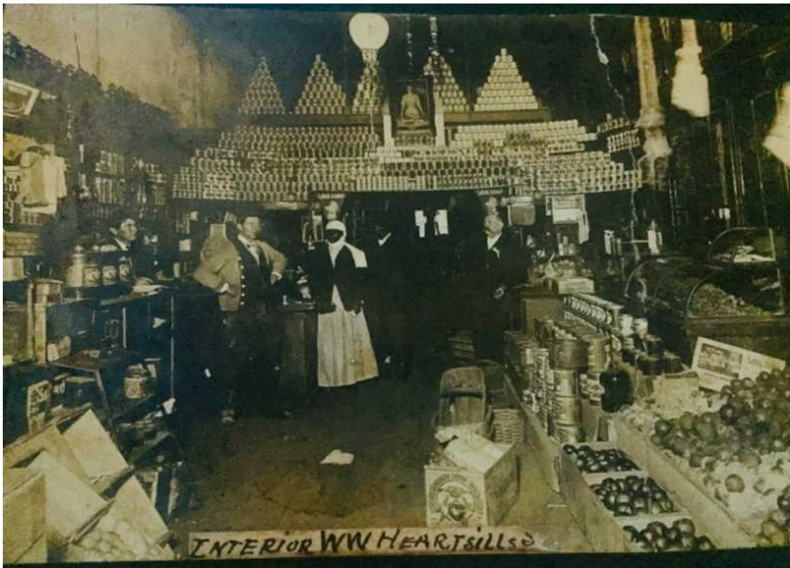
Heartsill’s store was located at 107 N. Wellington, NW side of the Square