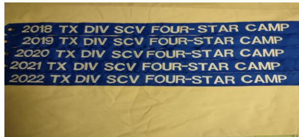
4-Star, 5 years running