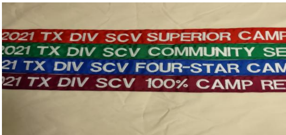
2021 TX DV Awards