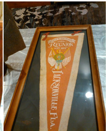
Pendant from 1914 Reunion