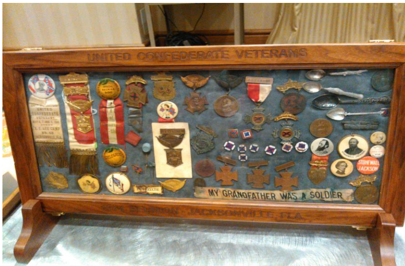
Pins and Button Collections from UCV