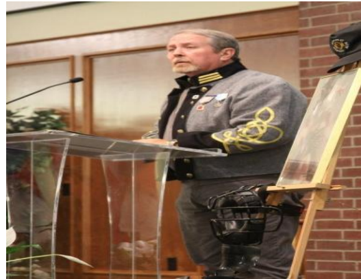
Reading proclamation of condolence