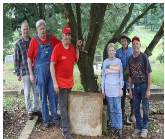
A proud moment as we were not sure we could get it back up