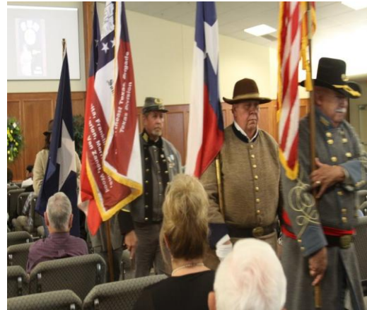
Flag bearers proceeding out