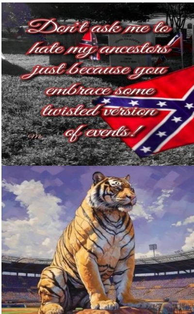
How about those LSU Tigers