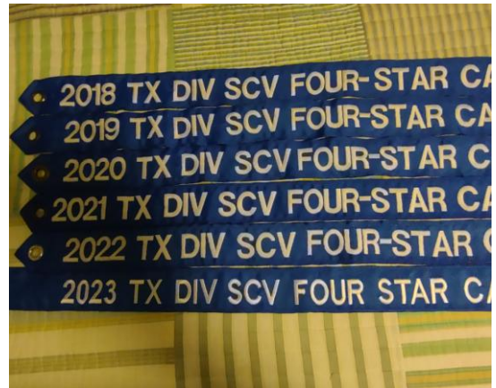
Only 4 out of 94 Camps won this.