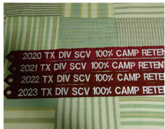
4 years in a row. 33 of 94 Camp received this.