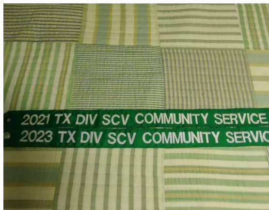
Only one Camp receives this award