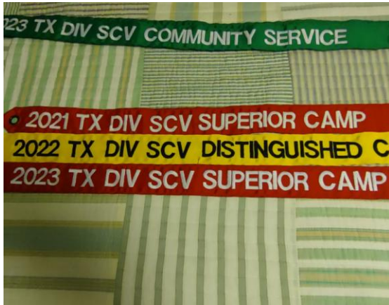
2021 #2 Camp out of 95. 2022 #1 Camp out of 95.