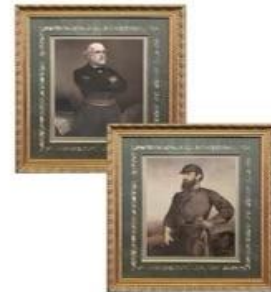
Framed prints of Generals Lee and Jackson to be auctioned at this event. Door prizes will be given as well.