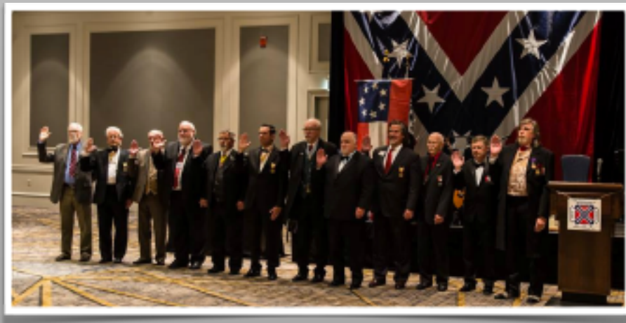
Newly Elected National Leaders Taking the Oath of Office