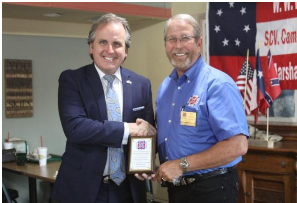
Our Camp presented the Senator with a plaque for his service to the “Citizens of Texas”.