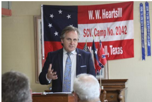
Senator Hughes fills us in on the last session.