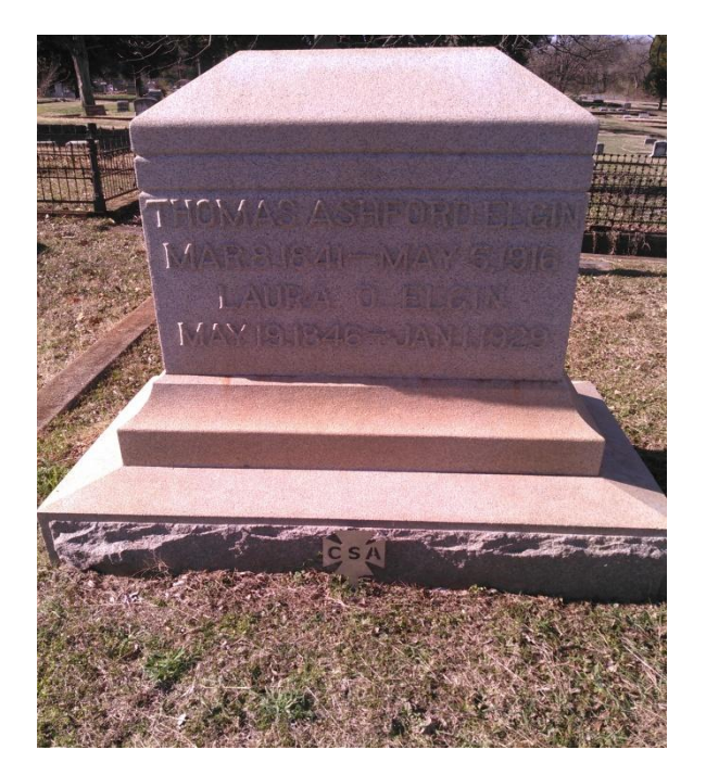
Center of Greenwood Cemetery