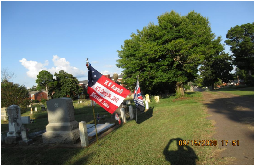
Camp Flags fly at W. W. Heartsill's final resting place during our September meeting