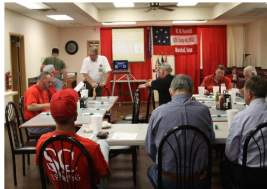
Starting the meeting