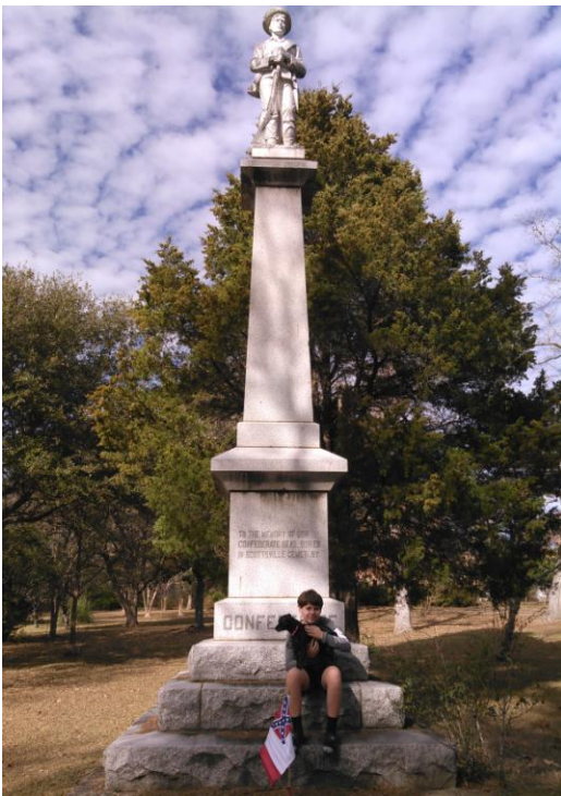
TJ and I went to the Scottsville Cemetery and changed out 30 flags there during the Thanksgiving Holidays.